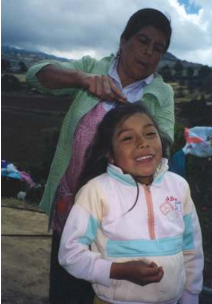
Her mother braids her hair every morning.

My mother is the first person to wake up in the morning. I wake up after her and the first thing I do is make my bed.