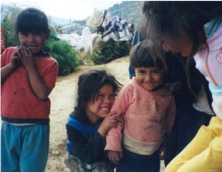
Enjoying her cousins