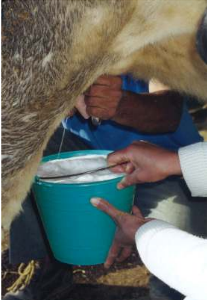
Milking the cow

About every other day, my mother milks the cows. I actually do not like to drink milk. I then wash the dishes with cold water and get ready for school.