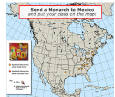
Fall Symbolic Migration Participant Map

Activity: After you send your butterfly on its journey to Mexico, let everybody know by posting to the map. Introduce your class ( Be sure to include the teacher's name, school, town, and state/province in your comments. ), upload a photo of your Class Ambassador Butterfly, tell what you are doing for monarchs, and share ideas and friendships.